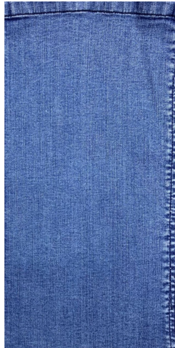
45 min enzyme wash + bleach