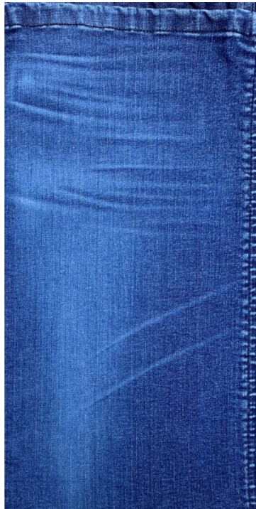
45 min enzyme wash + laser